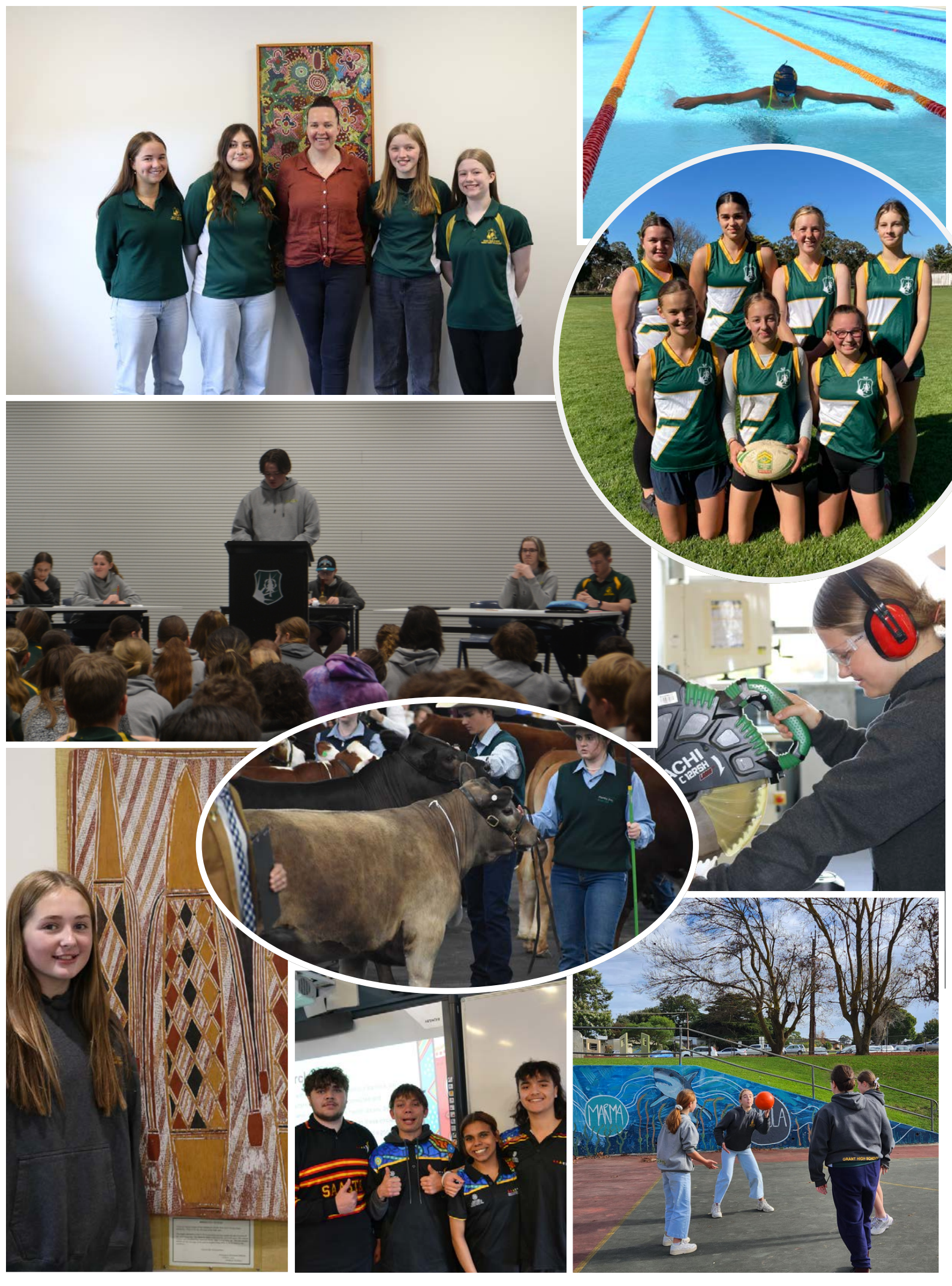
RESPECT TRUST COMMITMENT