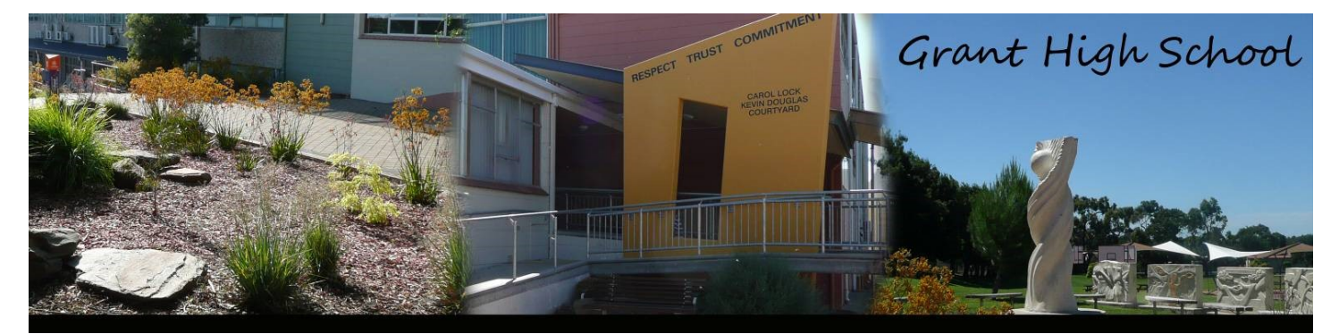
Issue No. 4